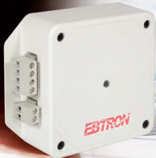
CO 2 / AIRFLOW OCCUPANCY COUNTERS