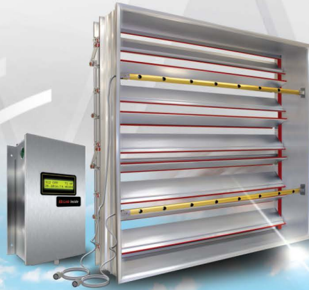
OUTDOOR AIRFLOW MEASURING DEVICES