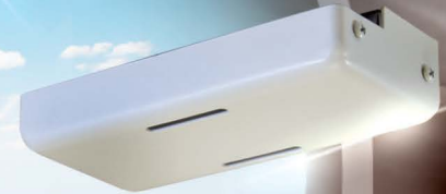
DOOR OCCUPANCY COUNTERS