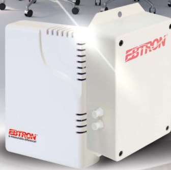
CO 2 SENSORS

A MEASURABLE DIFFERENCE FOR OVER 35 YEARS!